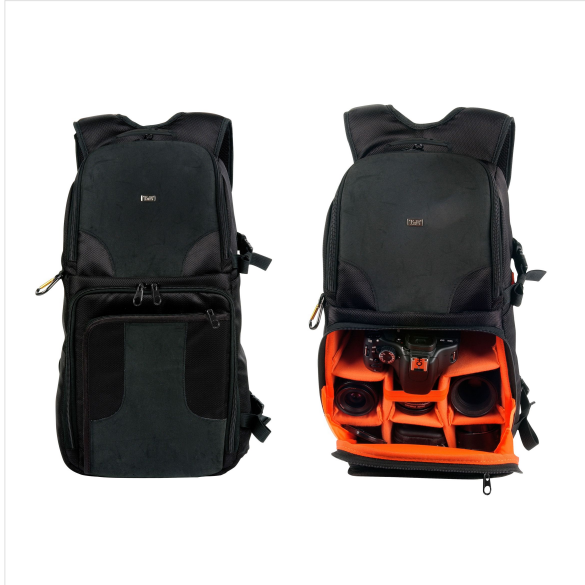
Image - Photo accessories - Camera bags