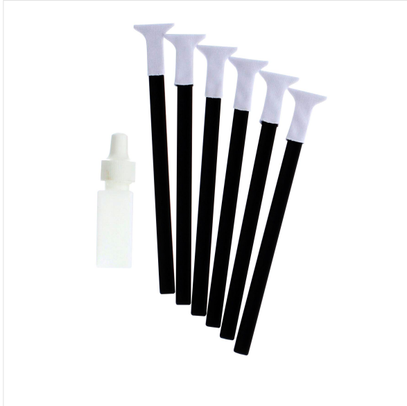
Image - Photo accessories - Camera cleaning

Pack of 6 swabs which measure 16mm and 3.6 ml bottle of cleaning solution in a handy spray format. Clean all the greasy stains and dry marks Compatible with CCD and CMOS sensors.